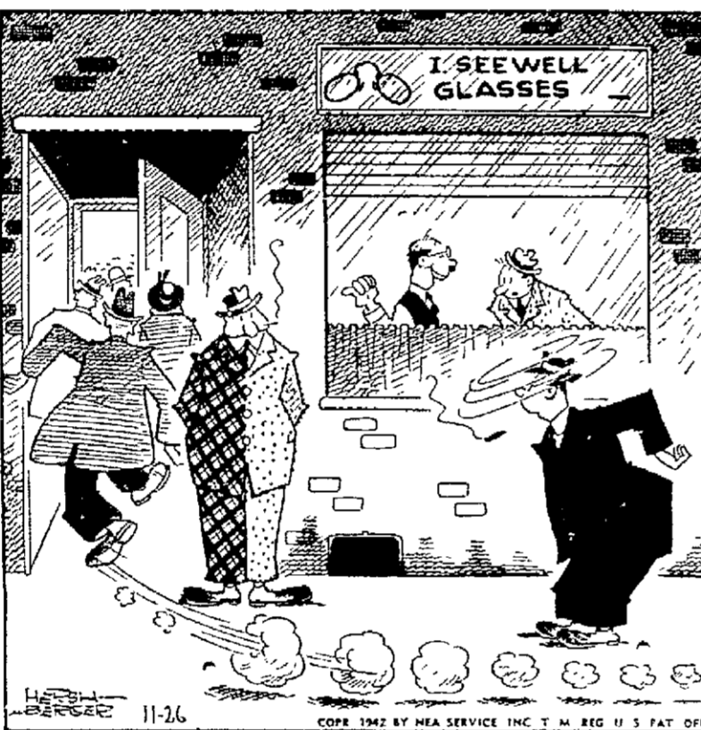
"Business has doubled since I hired him to stand outside in that suit—people think they're having all kinds of eye trouble!"