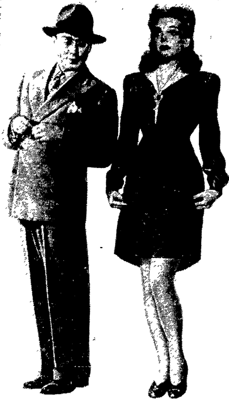
Lovely Ann Sheridan and laugh-maker Jack Benny furnish plenty of laughs in "George Washington Slept Here," Thanksgiving Day attraction at the Ohio theatre.