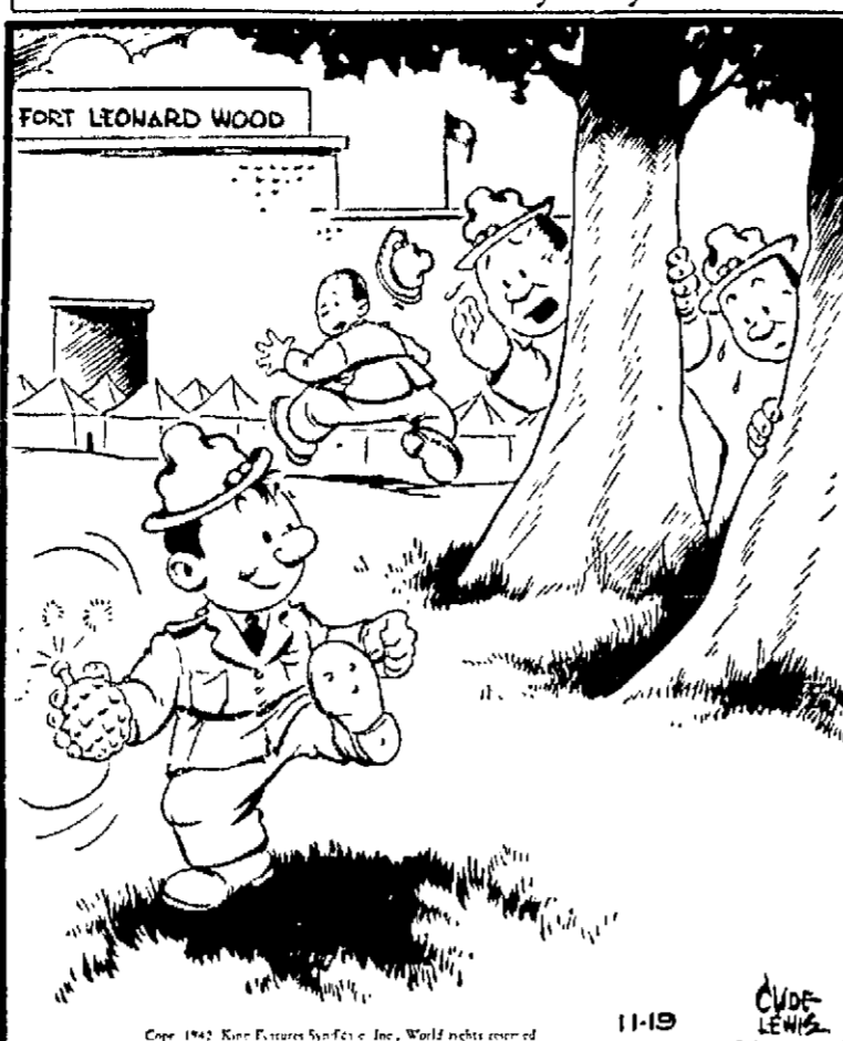
"Never mind showing us your curves. Get rid of that grenade—and FAST!"