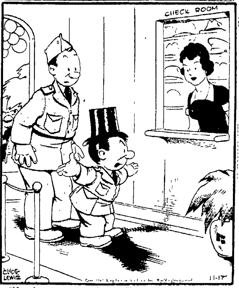
"Have it your own way, but you'll never convince me I left this hat with you tonight!"