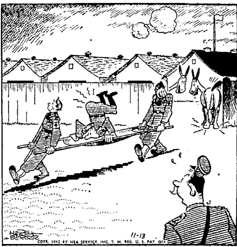
"It's a mule casualty!"

Sterling Holloway, Isabel Randolph, Mortimer Snerd and Ray Noble and his orchestra.