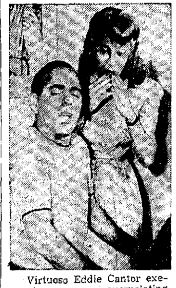
Virtuoso Eddie Cantor executes some excruciating boogie-woogie while Dinah Shore, singing star of his NBC "Time to Smile" show, registers alarm.