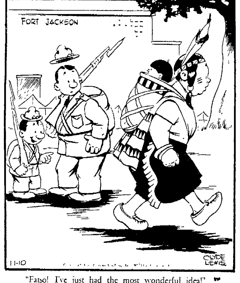
"Fats! I've just had the most wonderful idea!"