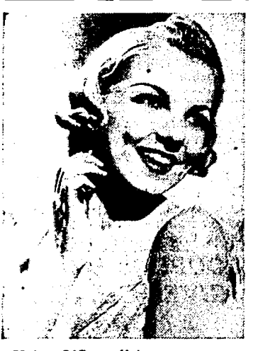
Helen O'Connell is songstress on the Navy Bulletin Board show presented over W-G-N and Mutual at 5:30 p. m. Saturdays. Jimmy Dorsey's music is featured.