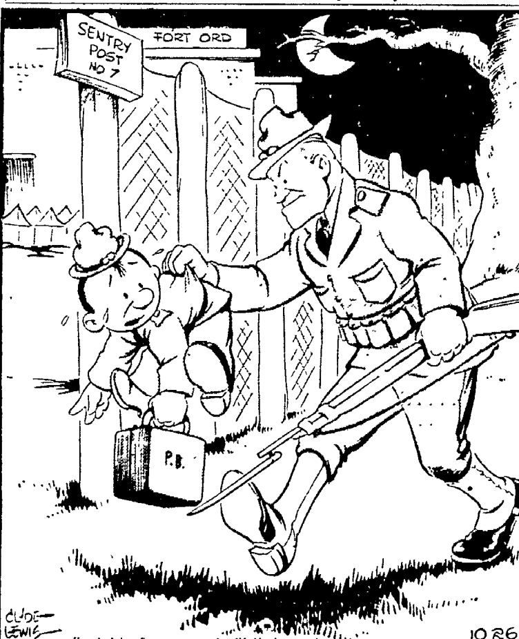
"But, Sentry, I ALWAYS take my vacation the last week in October!"