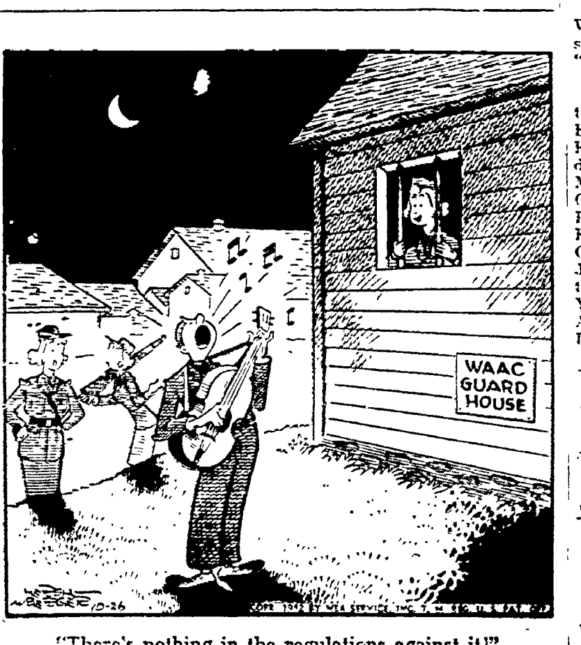
"There's nothing in the regulations against it!"