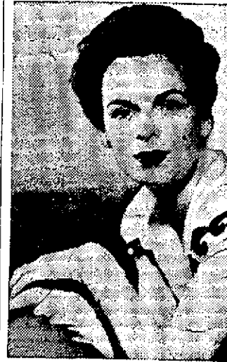
Often called "radio's most versatile actress," Mercedes McCambridge recently went east to take a lead role in "Abe's Irish Rose."