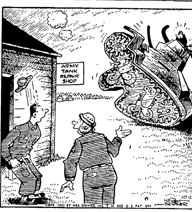
"We bumped into a couple of former Minnesota tackles during maneuvers!"