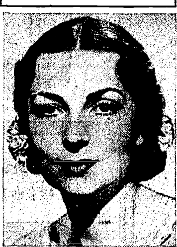
Agnes Moorhead of the stage and movies is featured on the Lionel Barrymore show, "Mayor of the Town," broadcast over WBBM-CBS at 8:30 p. m. Wednesdays.

9:30-W-G-N-Service Men's show. W51C-Concert Galatées. WIND-Nine-Thirty Edition. WBBM-Man Behind the Gun [C]. WCFL-News reports.