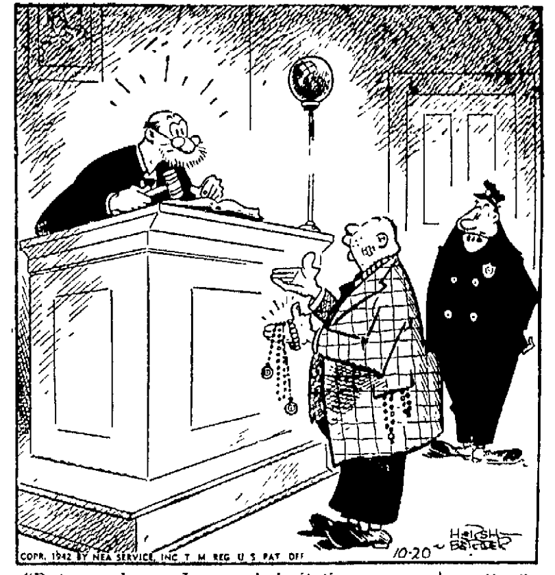
"But, your honor, I was only imitating a squirrel-putting", stuff away for the winter!"