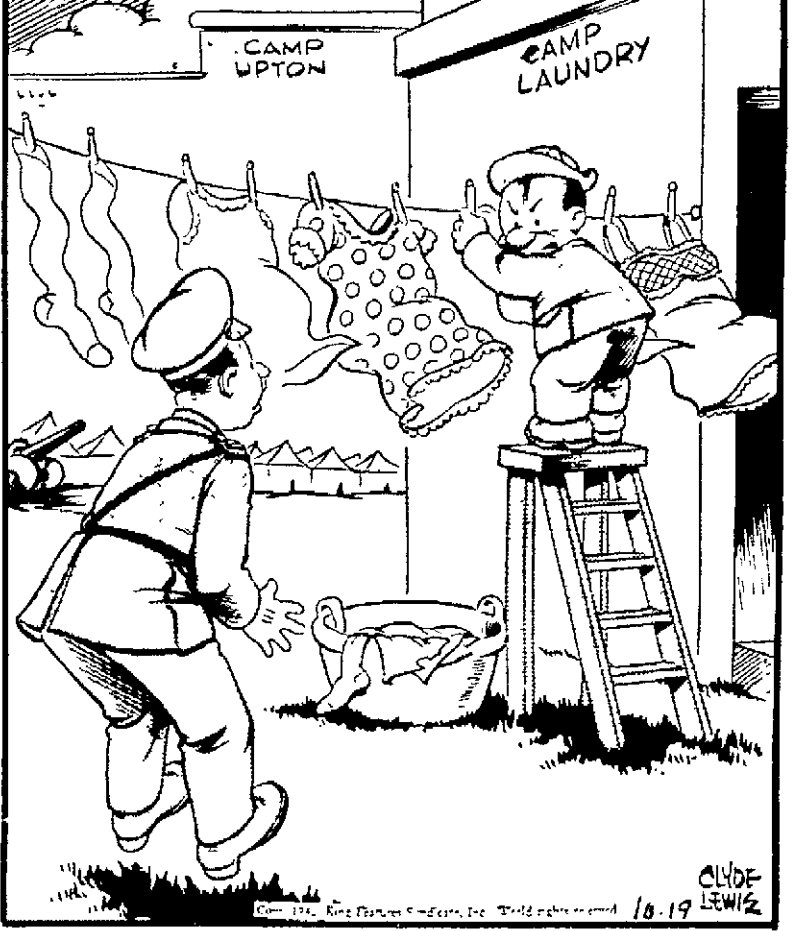
"I made the mistake of showing my wife our new washing-machine when she was here!"