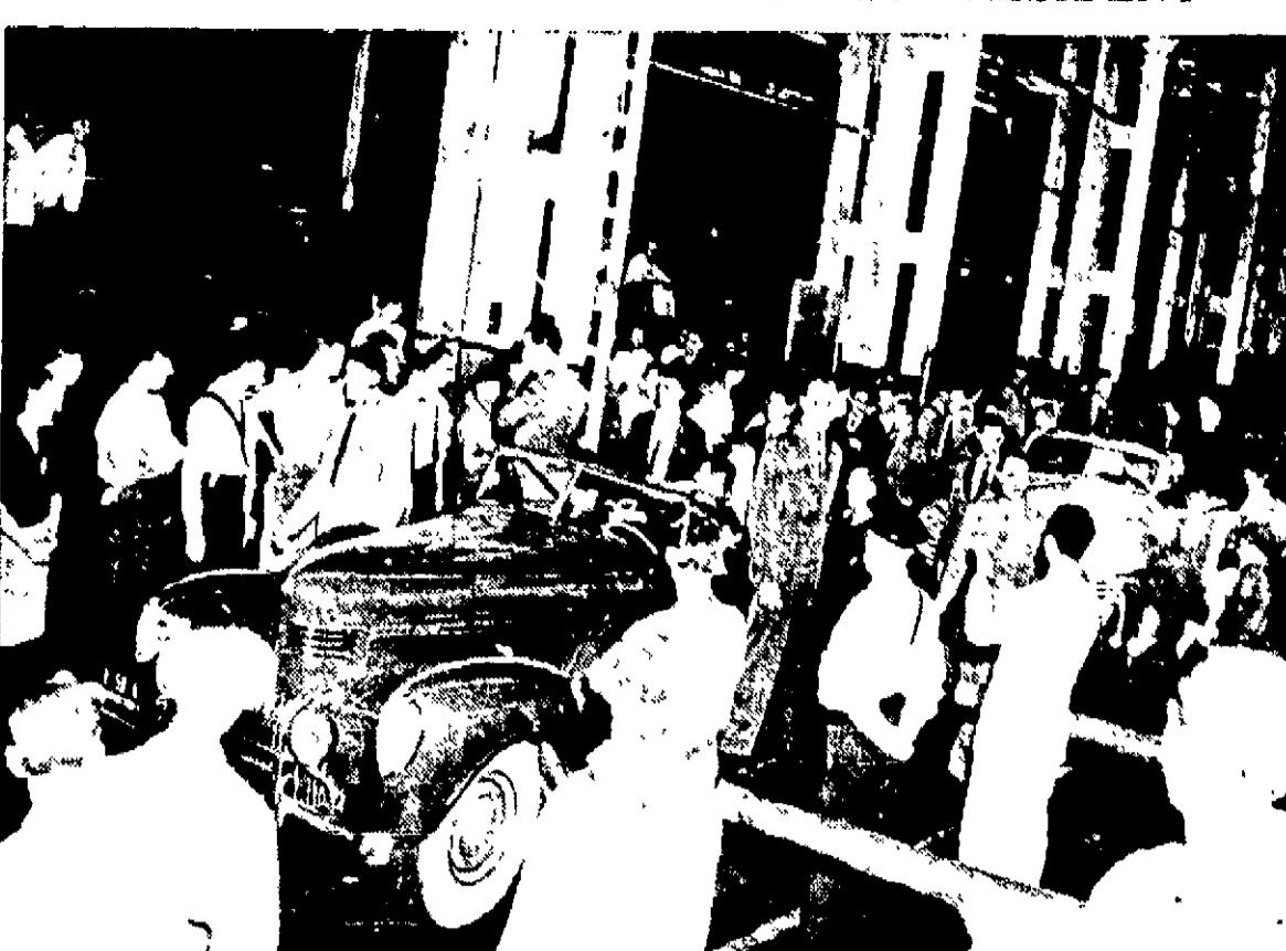
Halting work briefly, workmen at the Chrysler tank arsenal in Detroit, greet President Roosevelt as he drives thru the great factory on a tour of inspection which took him to armament plants across the country.