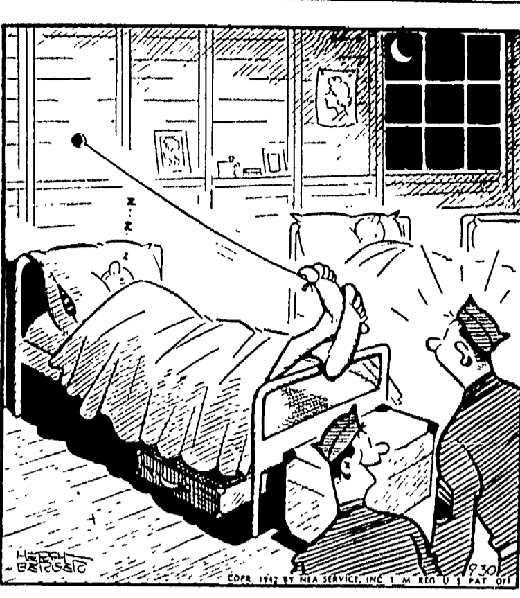
"Bugle calls don't wake him—so the bugler just pulls the string!"