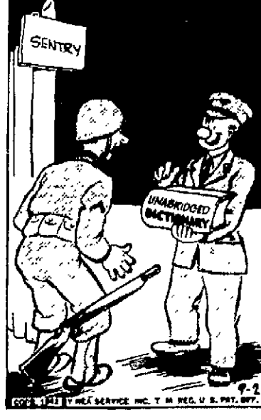
"Sure I got the password—right in here!"