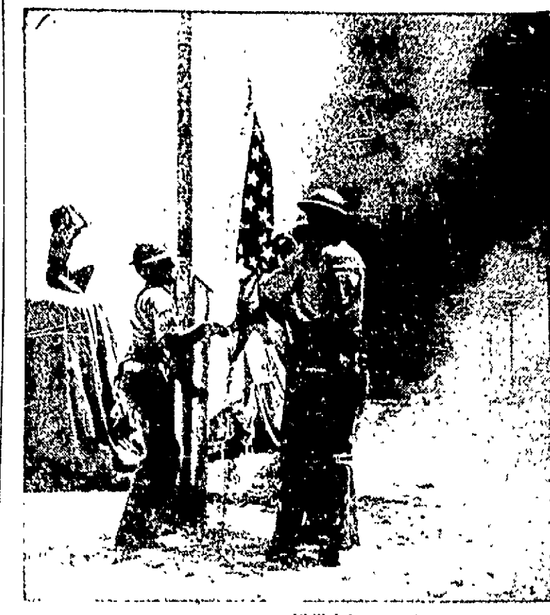
Old Glory goes up on Midway Island at the height of the battle there in early June. Because Jap bombers attacked before normal flag-raising hour, emblem was raised under fire.