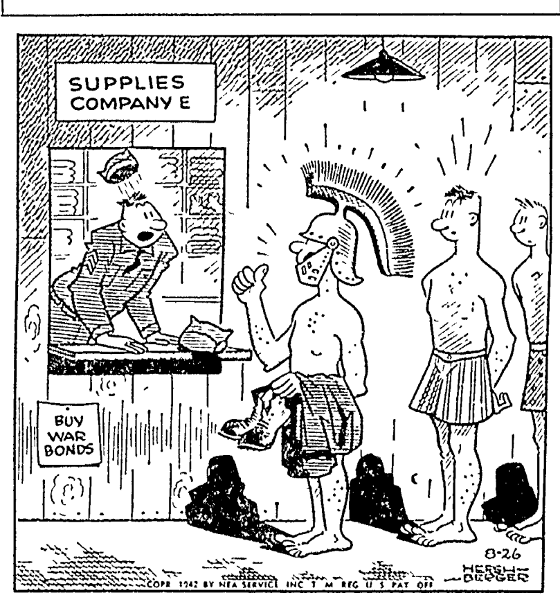
"If you don't mind, I'll wear this-it looks more devas-

This obelisk was erected in colonial Sucre, Bolivia, (then known as Chuquisaca) from fines levied on