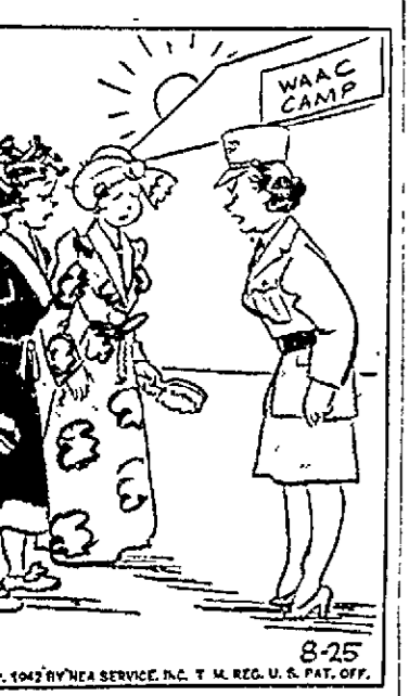
"Come, come, girls—this is no way to show up for reveille!"