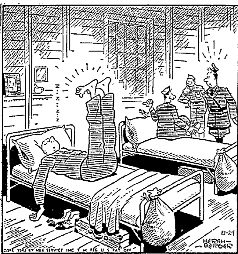
"He wants his feet as far from the earth as possible—he's just back from a 20-mile hike!"