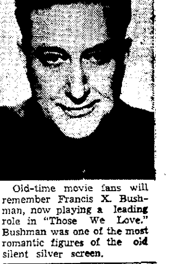
Old-time movie fans will remember Francis X. Bushman, now playing a leading role in "Those We Love." Bushman was one of the most romantic figures of the old silent silver screen.