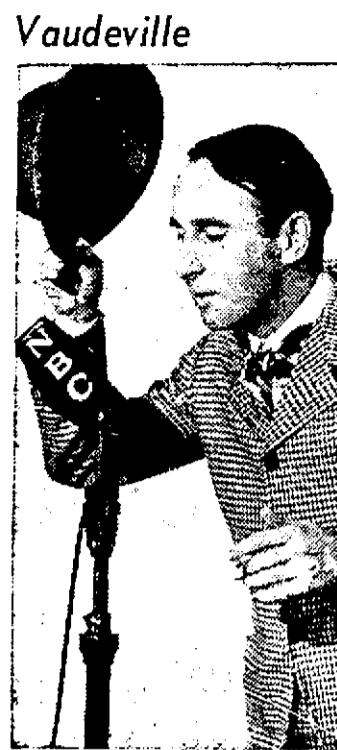
Vaudeville looks as well as it sounds in the person of Walter O'Keefe, Mc of the WIBA show relieving Charlie McCarthy for summer Sundays at 7 p. m.

WIBA will feature three top-flight variety shows tonight starting an impressive array of film celebrities.