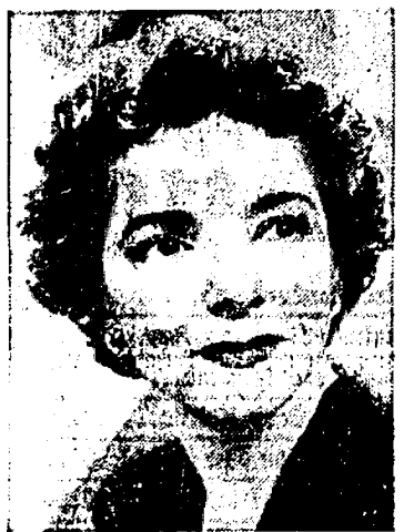
Helen Hayes, famous actress, will appear on the premiere broadcast of the Stage Door Canteen, over WBBM-CBS at 8:30 o'clock tonight.