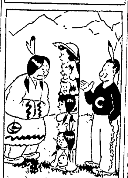
"A new idea for a totem pole I picked up in college, Pop!"