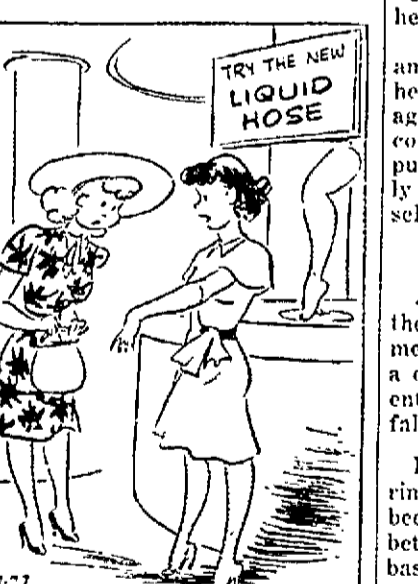
"They're really not gloves—I just spilled my stockings!"