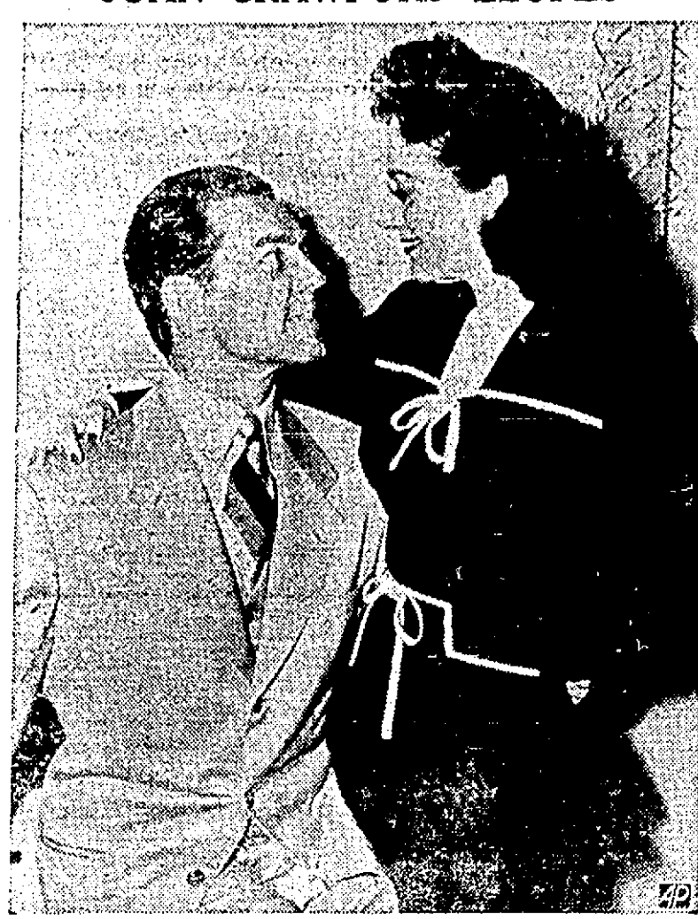
Film Actress Joan Crawford and Actor Phillip Terry appeared together at their Hollywood studio with the announcement they were married at a Ventura, Calif., county ranch. It was the third marriage for Miss Crawford, previously wed to Douglas Fairbanks, Jr., and Franchot Tone.