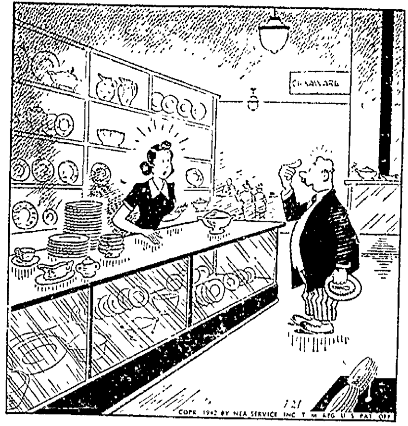
"Only two pieces left in the set this time—my wife makes it on the second shot now!"