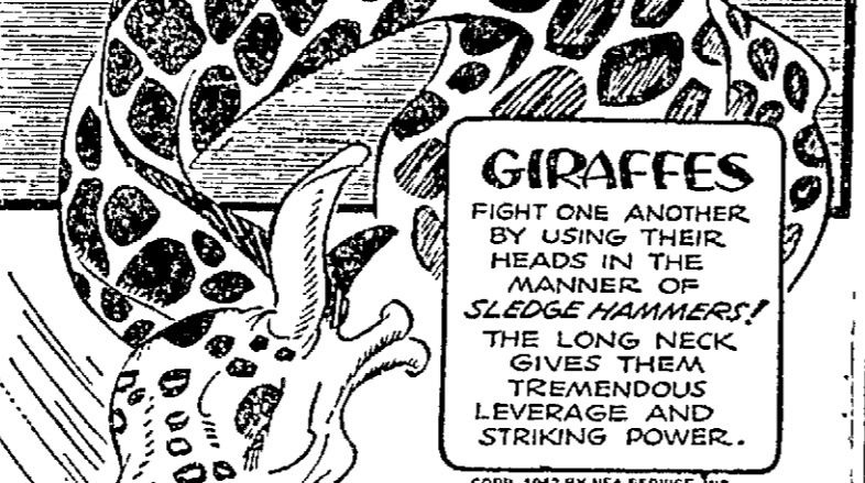
FIGHT ONE ANOTHER BY USING THEIR HEADS IN THE MANNER OF SLEDGE HAMMERS! THE LONG NECK GIVES THEM TREMENDOUS LEVERAGE AND STRIKING POWER.