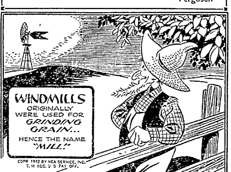
WINDMILLS ORIGINALLY WERE USED FOR GRINDING GRAIN... HENCE THE NAME "MILL!"