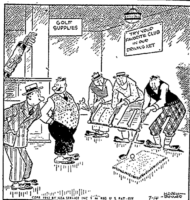
"It's our new tandem club to help conserve the golf ball supply!"