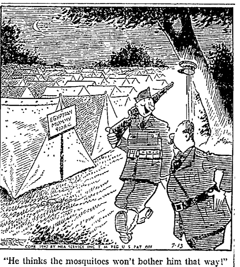
"He thinks the mosquitoes won't bother him that way!"

Vino-st are on a motor trip thru the Great Smoky Mountains.