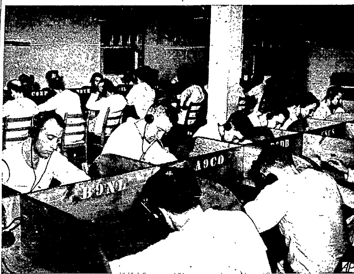
Three hundred navy enlisted men from 30 states are enrolled in a radio school at Miami university, Oxford, Ohio. Here is a group in a classroom, located in one of the men's dormitories, studying radio code. After graduation these men will be used on ships. The enrollment is expected to reach 600 by September.