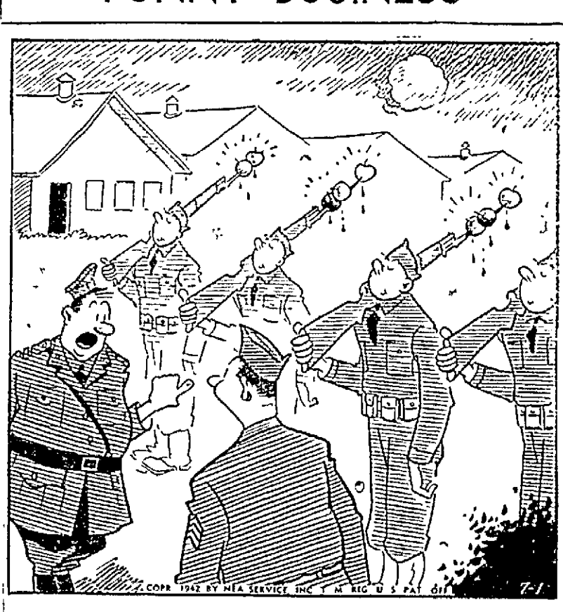
Sergeant, hereafter you will march your men around the apple orchard instead of through it!"