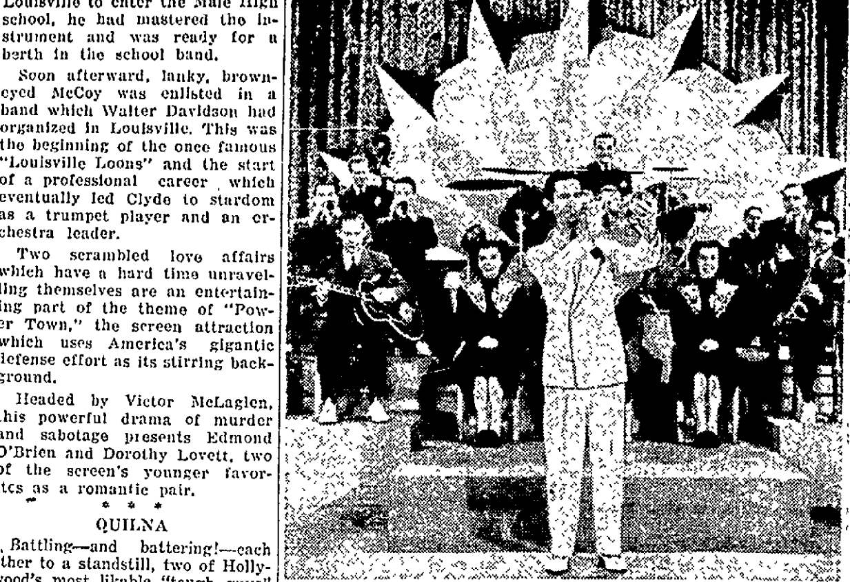
Clyde McCoy and his famous "Sugar Blues" orchestra will be on the Ohio stage Friday only, presenting four performances. McCoy is shown above in front of his band.

Pat has annexed the prettiest girl in town. Miss Blair thus figures merely as an added reason for the military discord which enlivens "Two Yanks in Trinidad," a fact that she uses to advantage in her career as a cafe hostess. But the private war between Pat and Brian, which makes them headaches in uniform to their superiors, transcends even such lovelies as Miss Blair. About the only thing to top it is the bigger war with which the soldiers become involved, a major conflict which leads to the excitement-thundering action of a spy hunt and an enemy plot to destroy the U. S. Fleet by means of deliberately-loosened mine fields in the harbor at Trinidad.