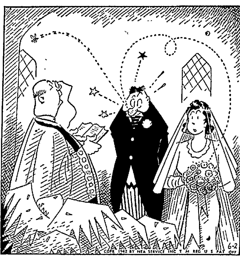
"Do you take this man or one lump for your lawfully wedded husband?"