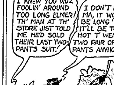
"I KNEW YOU WUZ FOOLIN' AROUND TOO LONG ELMER! TH' MAN AT TH' STORE JUST TOLD ME HED SOLD THEIR LAST TWO PANTS SUIT!"