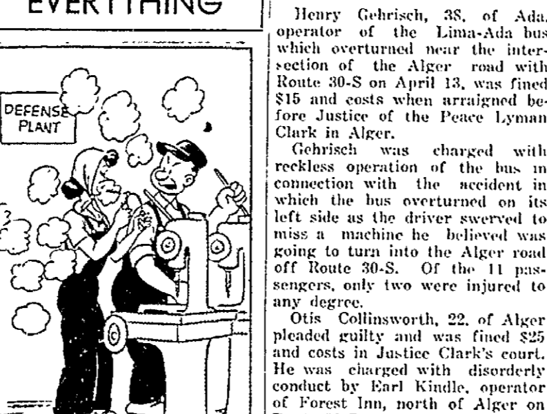
"Take it easy, Gertie! Do ya want me to catch the dickens from my wife again?"