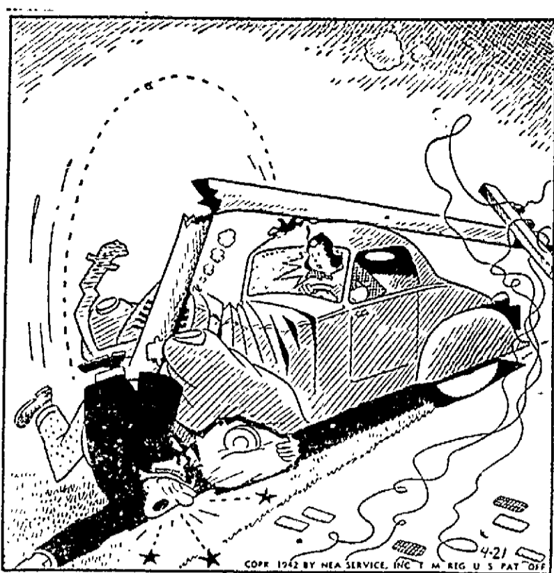
"Thank heavens it's over, dear—I've been expecting this for 20 years!"