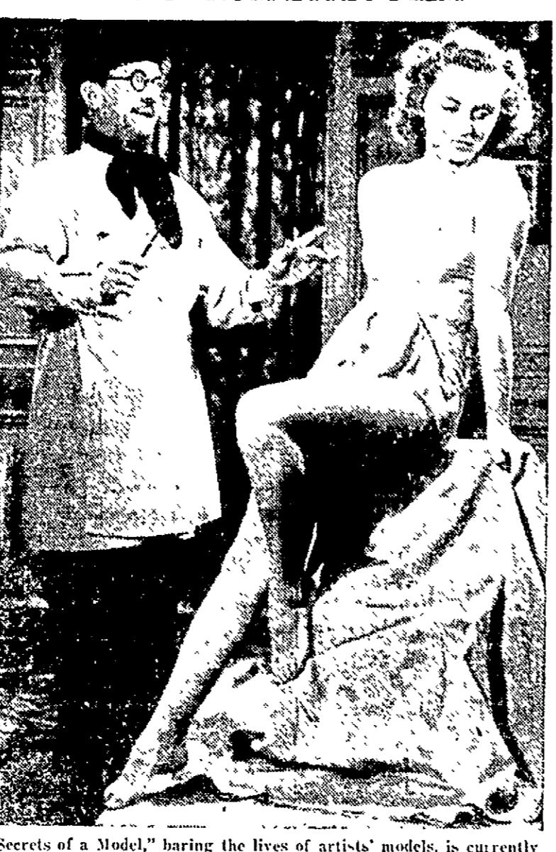
"Secrets of a Model," barring the lives of artists' models, is currently at the Lyric theatre.

then on, the cops are constantly after me. Among the superman things I have to do, I have a man into the face of a cop. I get in a fight and the other guy tosses me over his head and knocks me cold. "I steal an ambulance and run a mad race thru downtown traffic. Again, I am chased by a couple of tough henchmen who sideswipe my car and turn it over with me in it. And these are only in the first three reels.