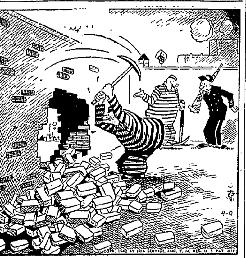
"A couple of friends on the outside want in!"