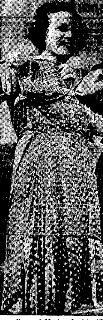
Jim and Marian Jordah, "Fibber McGee and Molly" whose Tuesday laffcast is heard at 8:30 p. m. over WIBA, take time out for some desert air at one of California's popular resorts.