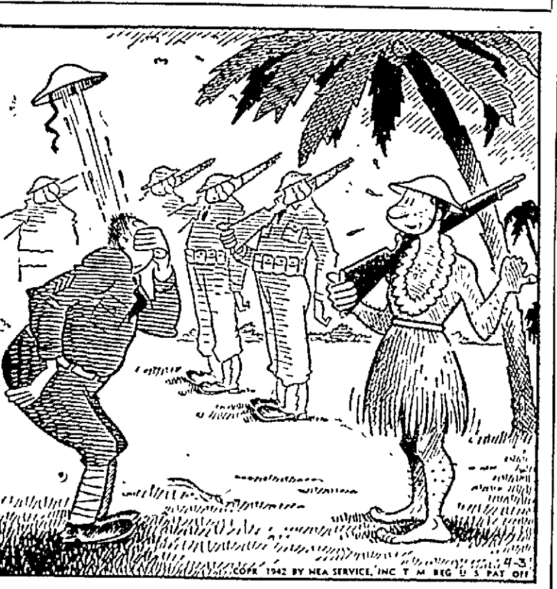
"I traded my uniform to a native girl—this is more comfortable!"