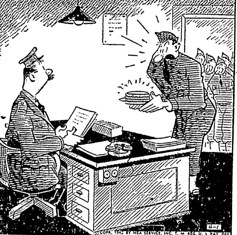
"Could I be put in the guard house for the duration of the cake I just received, Sir?"