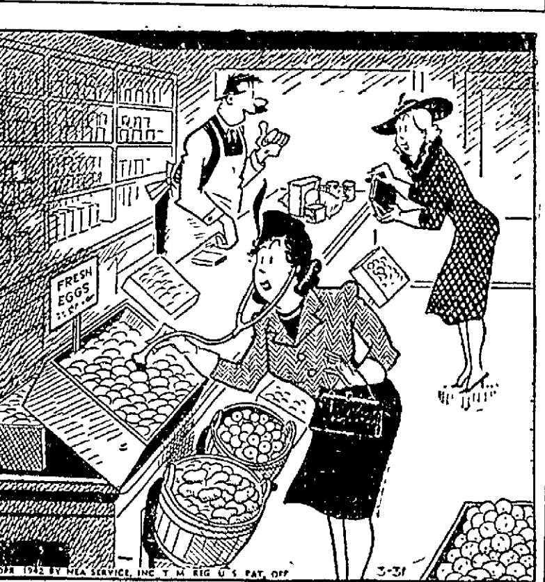
"It's the doctor's wife buying eggs again!"