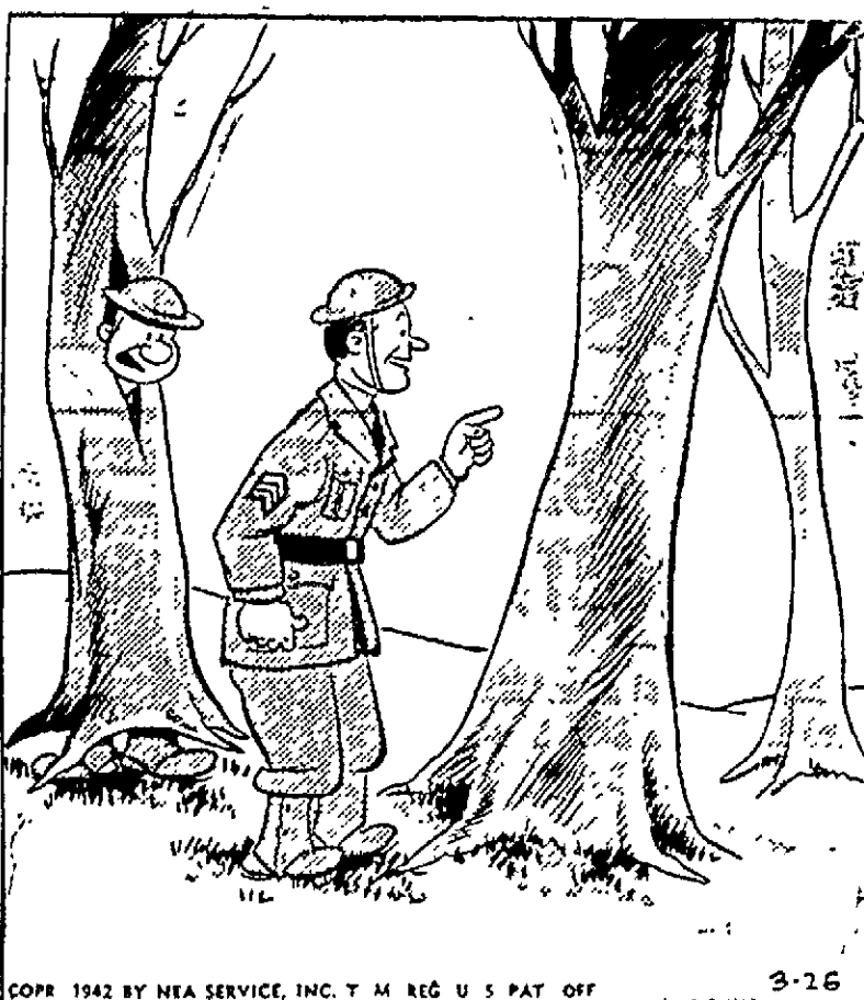
"Hey, Sarge, I'm over here!"