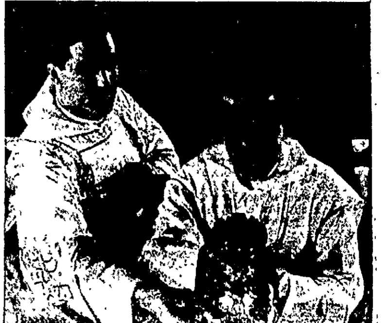
Here is a scene depicting "Offering of the wine" in the film "The Eternal Gift," which opens a three-day run Wednesday at the Sigma theatre. Sponsored by the Knights of Columbus, proceeds will be donated to St. Rita's hospital.