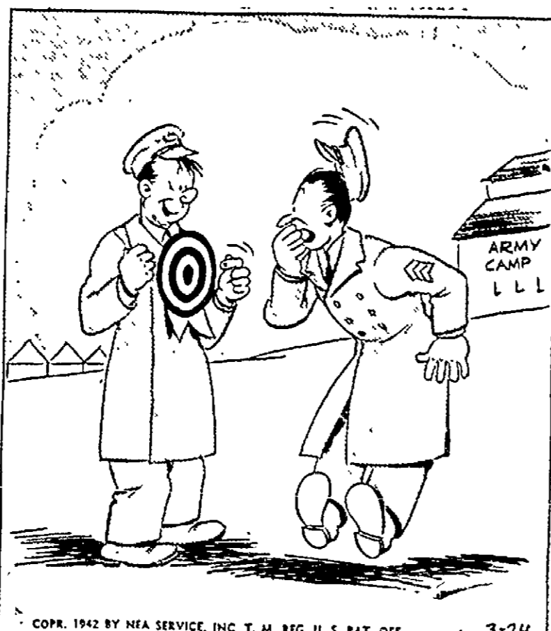
"Look, Sarge—a couple of the artillery boys pinned this medal on me!"