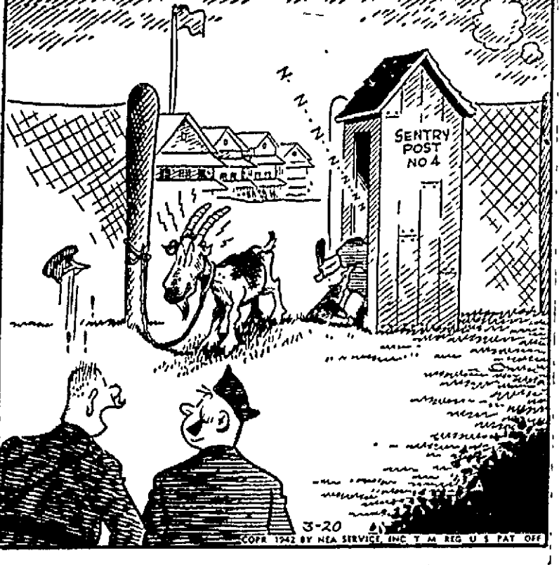
"He's taking his noon-day sicsta!"