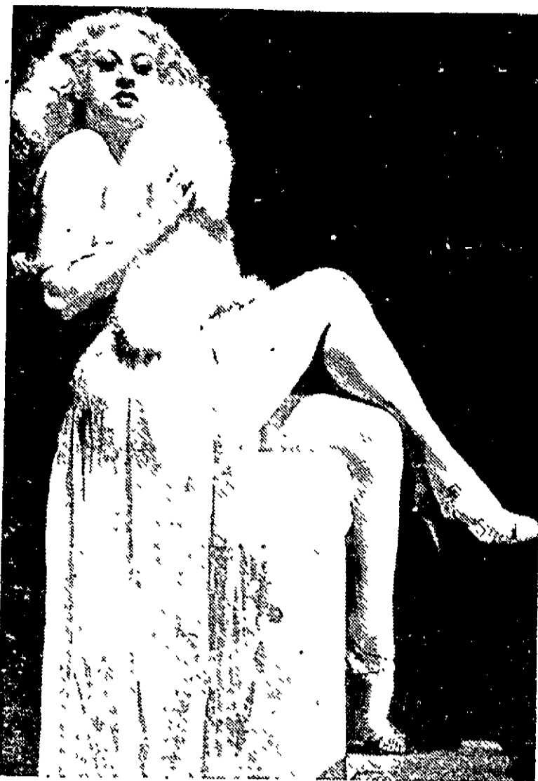
The feminine loveliness above provides a good idea of the attractive features of the Ohio stage show, "Midnight in Manhattan," which will be offered Friday only. On the screen is "Sing Your Worries Away."