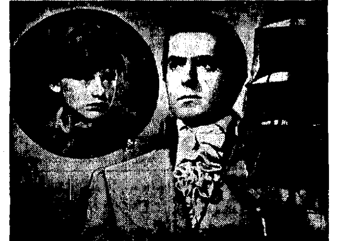
Young Roddy McDowall gives one of the best dramatic portrayals of his career as the young Benjamin Blake while Tyrone Power, as the adult Blake, continues the dashing characterization in the romantic adventure story, "Son of Fury," which starts Friday at the Orpheum. The cast includes Gene Tierney, Frances Farmer and George Sanders.