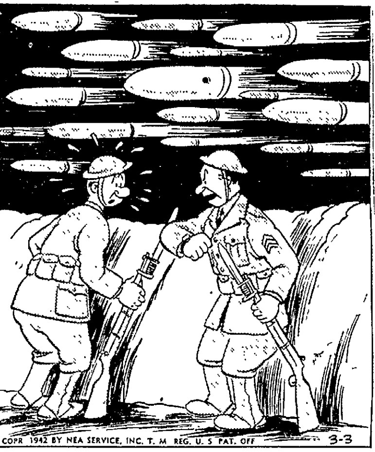
"Well, you've always wanted to advance in the army—now's your chance!"