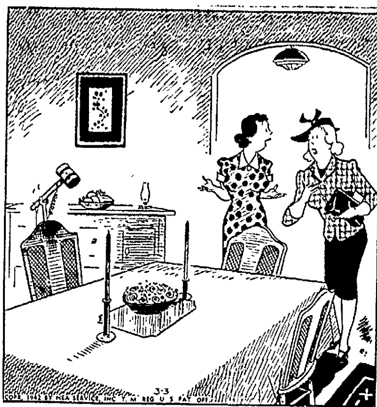
"If the guest reaches for a second spoon of sugar my husband presses a button and it bops him on the head!"