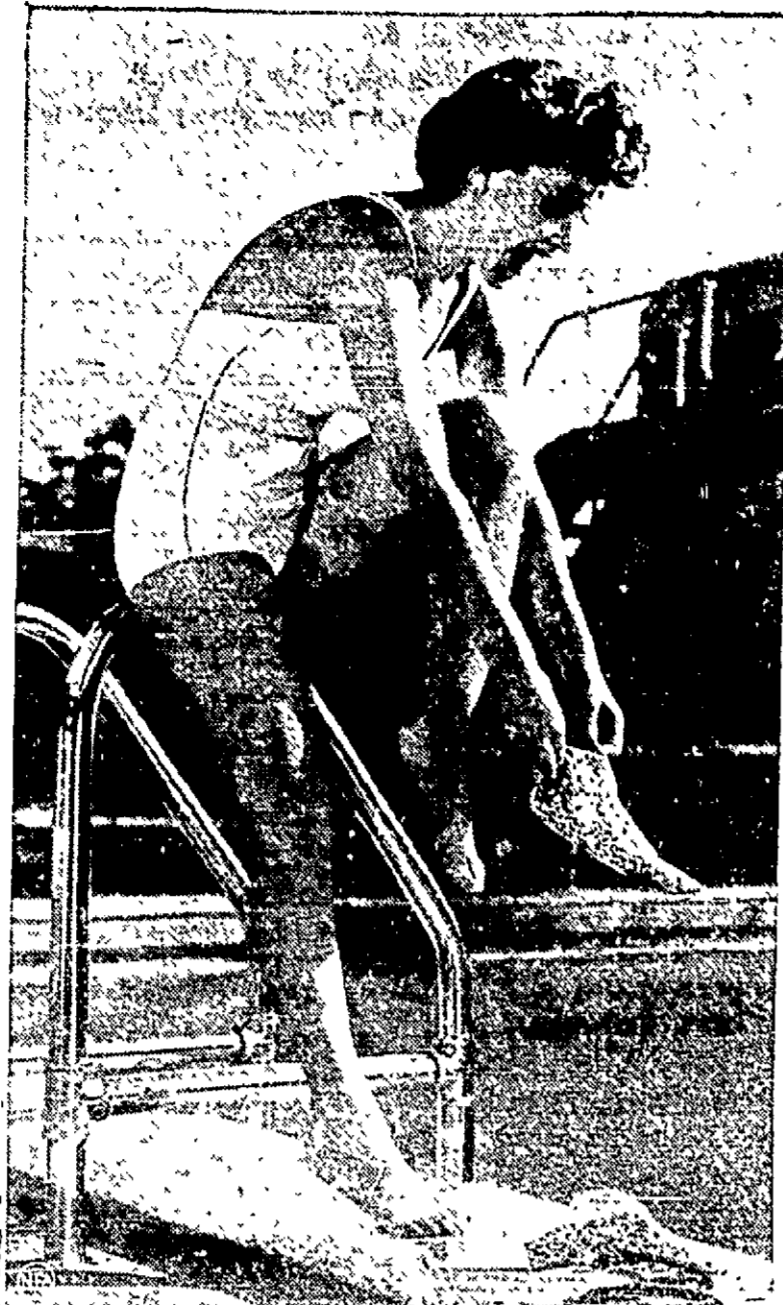
Just as a little matter of diversion, the quite-something Margaret Hayes teeters on the edge of a Hollywood swimming pool. She is quite a figure in the movies.