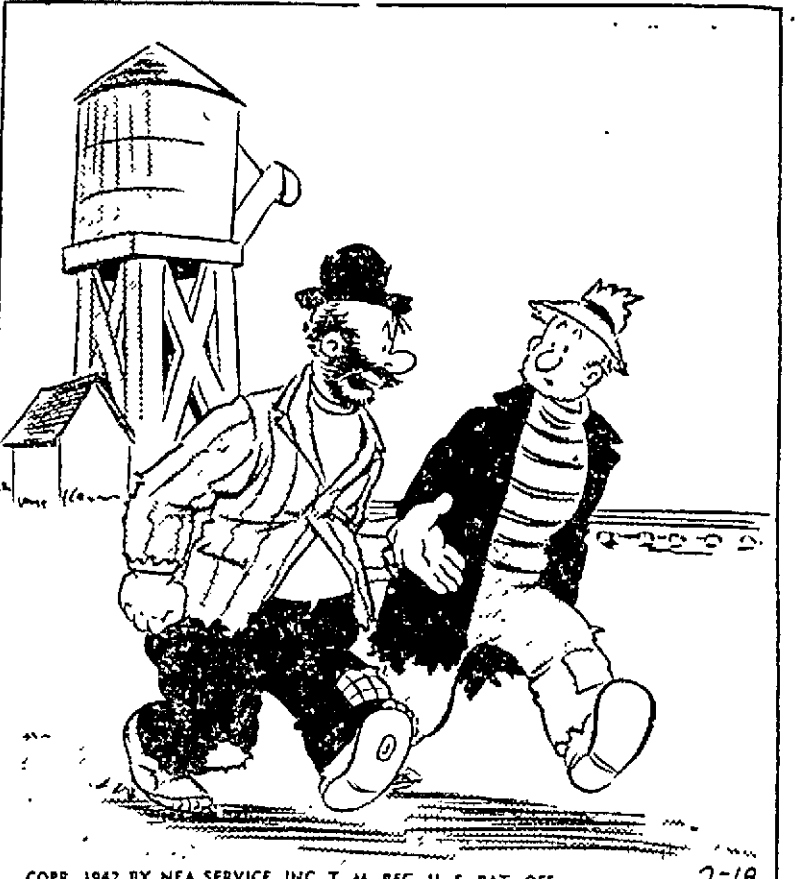
"Some people make me tired—you don't hear me griping because I can't buy any more tires!"