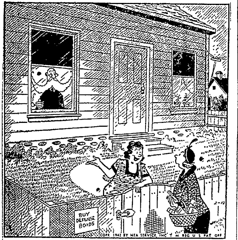
"Grandpa always sits at the window anyway, so I'm using his whiskers till the curtains come back from the laundry!"