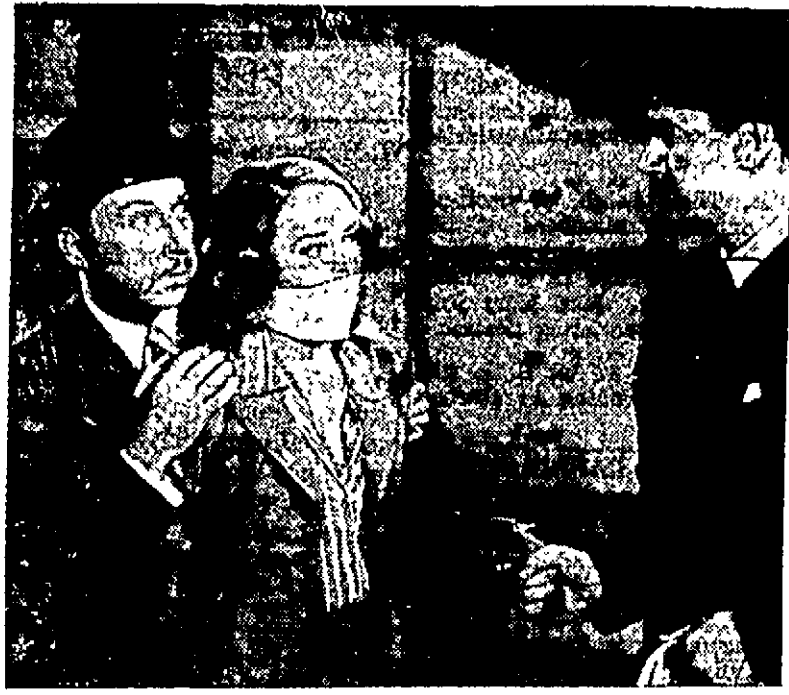
Franklin Pangborn, Virginia Gilmore and Douglas Fowley from "Mr. District Attorney in the Carter Case," current at the Lyric theatre.